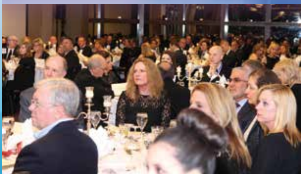
More than 150 SLMMS members and guests attended the banquet.

See a full album of banquet photos on the SLMMS Facebook page.